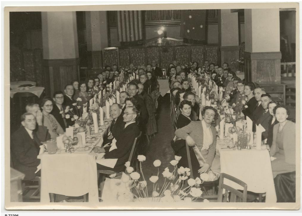
State Library of South Australia - Patrons at the Arcadia Cafe [B 72296], Patrons at the Arcadia Cafe, in the basement of the Bowman Building on King William Street, Adelaide. Approximately 1940. Part of King William Street Collection.