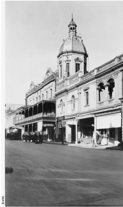
State Library of South Australia - Hindley Street, Adelaide [B 4785], [General description] West's Picture Theatre photographed from the opposite side of Hindley Street with the roadway in the foreground. The theatre has an impressive tower topped with a cupola. The shop with the awning (on the right) is D. Ellis, Confectioner. [On back of photograph] 'Acre 74 / Hindley Street, south side / 13 July 1928 / For view of a building erected on West's Olympia site in 1939 see B 9622 and B 9806. Site of West's Picture Theatre: Far side of tower is 2.5 yards west of the east side of Victoria Street. / Far side of Olympia Cafe is 9 1/2 yards west of the west side of Victoria Street.' According to a researcher, the spire/tower is the entrance to West's Olympia Theatre. It was demolished in 1938 to make way for the West's Theatre, which is now the ASO Grainger Studio. Approximately 1928. Photographer, State Library of South Australia. Part of Acre 74 Collection.